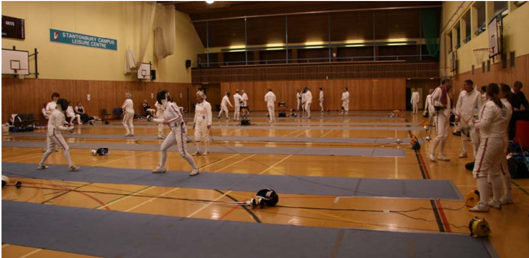
Spot some of the NVA committee at work and play!!