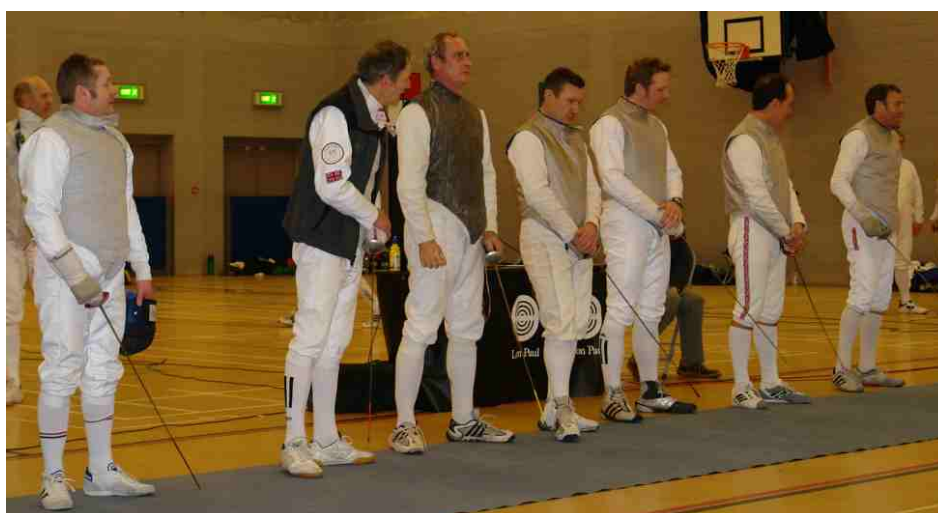
Men's Foil Finalists National Championships 2006