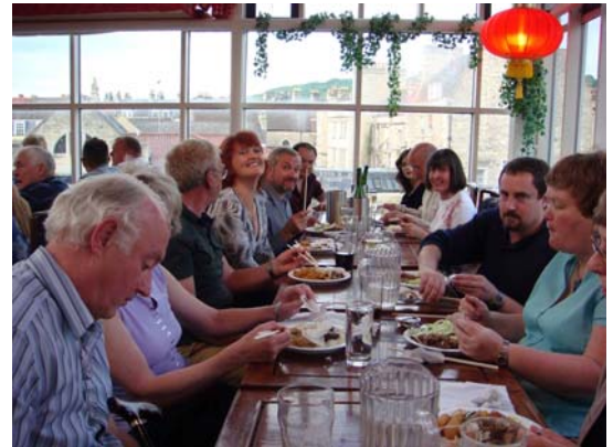
Fencers at rest!