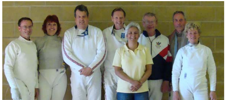
Most of the 3 teams: White Horse Team Trophy July 2007