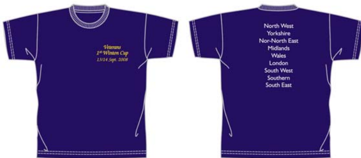
Veterans 1 st Winton Cup 13/14 Sept. 2008