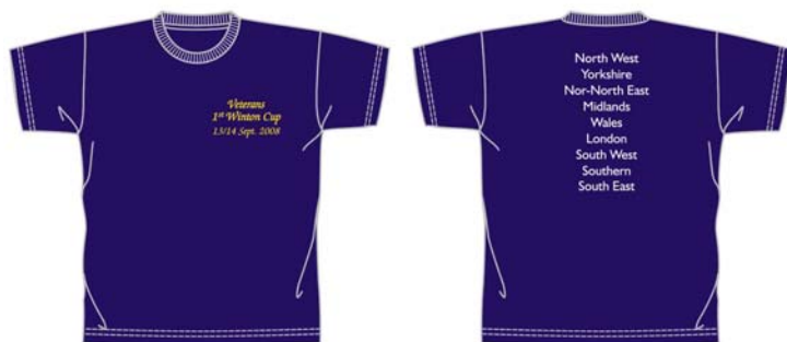
Veterans 1 st Winton Cup 13/14 Sept. 2008