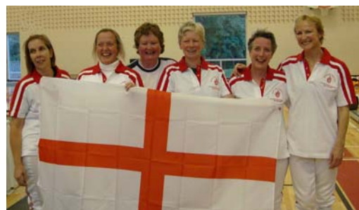
England A and B foil teams