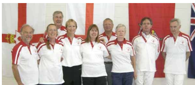
Part of the England Squad