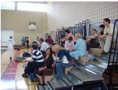
We also serve who sit and wait....