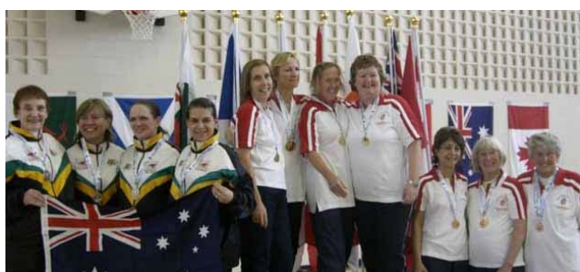
England A, Australia and England B Women's Sabre