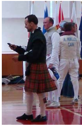
A Canadian-Scots Ref