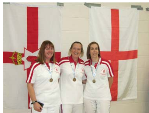
England Women's Epee A team

This edition: special thanks to all my roving photographers