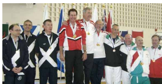
GB clean sweep at Men's Sabre