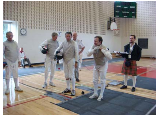
How could I resist this one?