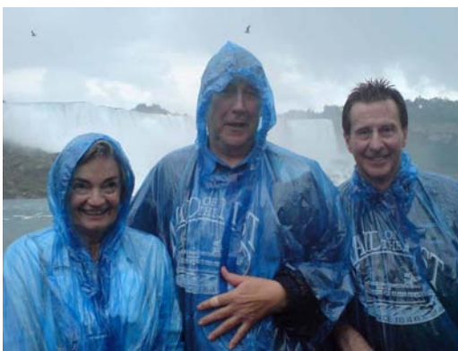
And I thought I had a bad hair day!!

CAPTION COMPETITION!!! SEND YOUR ENTRIES TO THE EDITOR (see front cover)