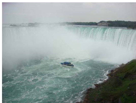
Niagara Falls and Maid of the mist