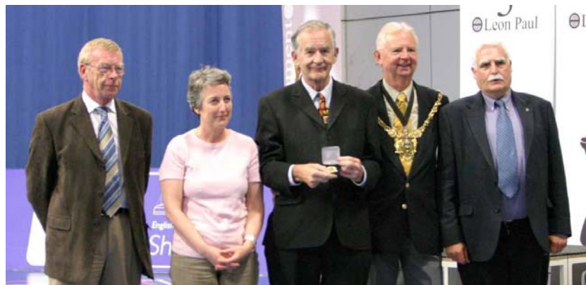
We accepted this on your behalf